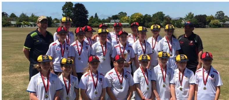
THE TWO FINALISTS FROM THE 2020 EVENT – CHRISTCHURCH AND DUNEDIN